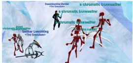
Chromatic blade best color. Chromatic blade wow.